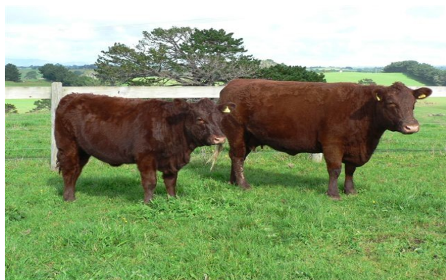
Dunnland Kauri Dainty and daughter Dainty 2 nd .