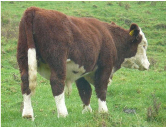
Red Devon x steer